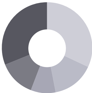
Silver Circle constituent graph: